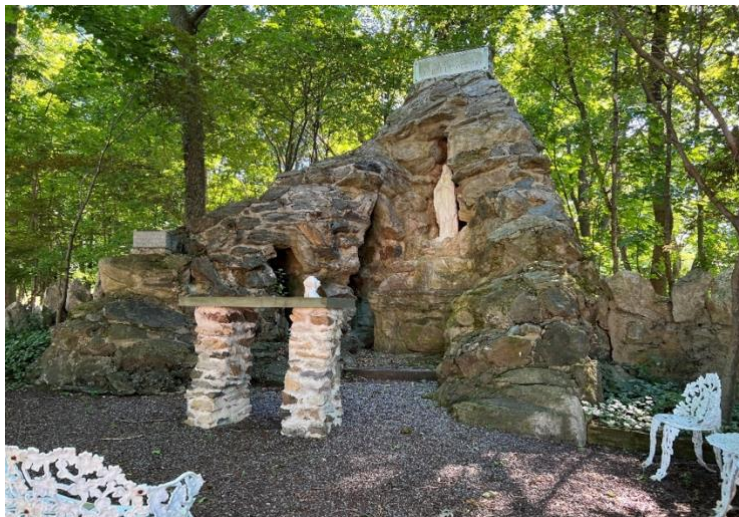
Fig. 3 The Grotto pictured in 2022. Note altar added at front.

remembrance of local veterans, as the Knights of Columbus organize each Memorial Day, our parish has been blessed by the efforts of those who envisioned, constructed, and maintained the site for more than a century.